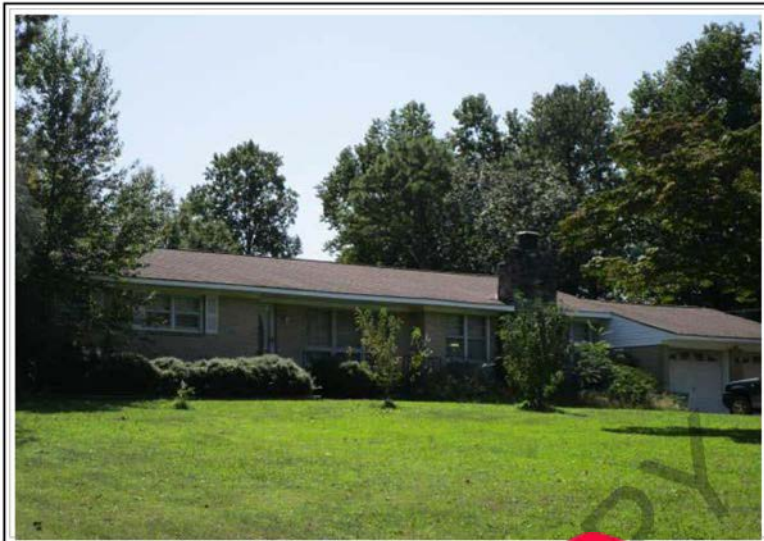
FRONT VIEW OF SUBJECT PROPERTY

Appraised Date: September 8, 2017 Appraised Value: $ 155,000