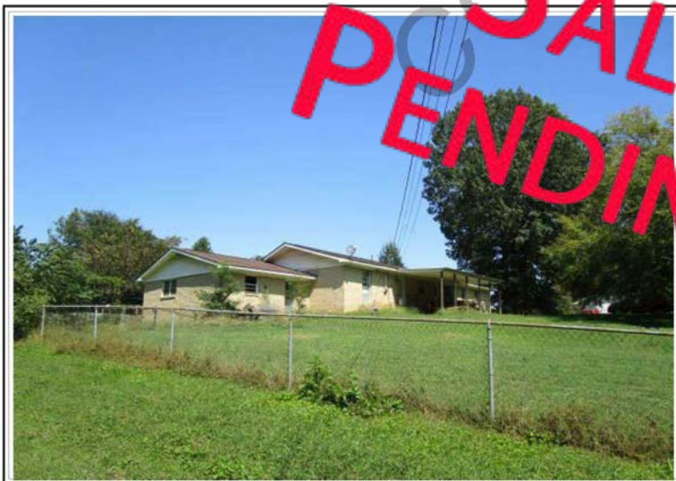
REAR VIEW OF SUBJECT PROPERTY

Appraised Date: September 8, 2017 Appraised Value: $ 155,000